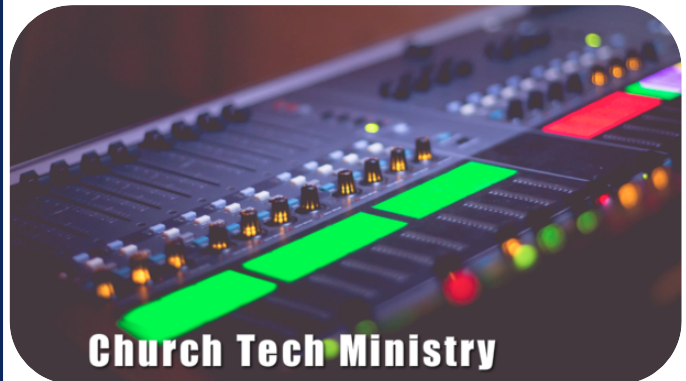
Church Tech Ministry